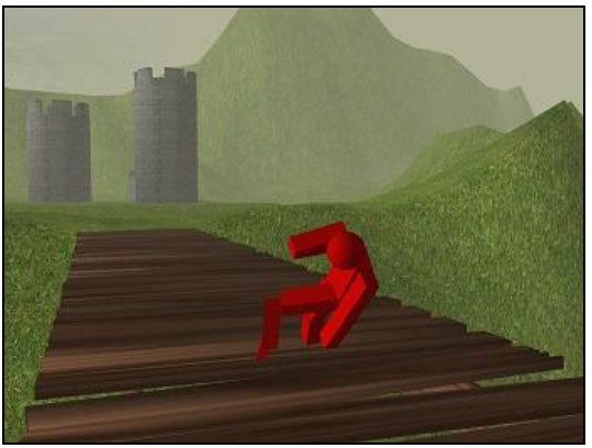
Figure 6: Artificially Intelligent Human

environments with artificially intelligent agents.