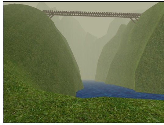
Figure 2: Terrain

Tyler Streeter Virtual Reality Applications Center Iowa State University Ames, IA 50014 streeter@vrac.iastate.edu