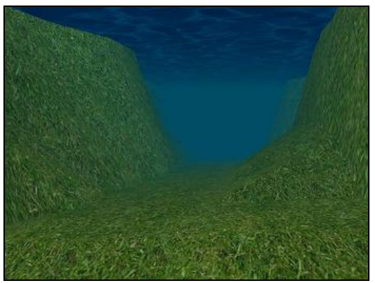
Figure 3: Underwater

The application should be simple enough so that a child could operate it safely and without any problems [3], but still have enough interactivity in it that even an experienced VR veteran will be able to have fun while performing some of the interactions inside the environment. The interactions and dynamics in the world should all be realistic so that they are more believable to the user.