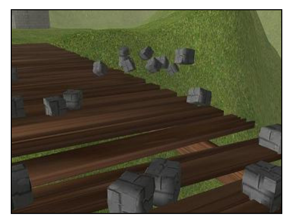
Figure 4: Throwing Bricks

Using a robust dynamics engine creates endless ways for users to interact with the virtual environment without being forced to see pre-scripted animations. For example, users in the Medieval Playground can pick up bricks or pieces of wood, carry them to new locations, and throw them (Figure 4). There is also the possibility of using objects as tools to perform some task (e.g. stacking blocks to climb onto a high ledge or using a hang glider to float across a chasm).