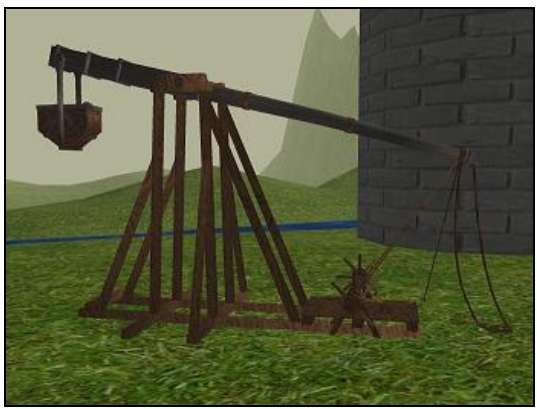
Figure 5: Simulated Trebuchet

The dynamics engine allowed us to create a realistic trebuchet (Figure 5) that works based on physical principles rather than prescripted animation. This trebuchet lets users launch various objects found in the world. It even lets users launch themselves through the air if they decide to. The dynamics engine lets a lot of interesting interactions happen and it allows realistic interactions that the users comes up with on their own, without the programmer having to worry about every action that the user might do.